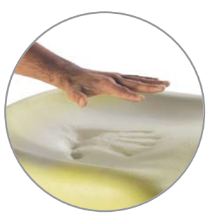
Memory Foam (MF): Slow release memory foam evenly distributes body weight, helping to minimize pressure points and ease blood circulation. Optional.

Ergonomics is the study that deals with the interaction between humans and their activities. It is the practice of designing an environment to adapt to the characteristics of the people who are within it.